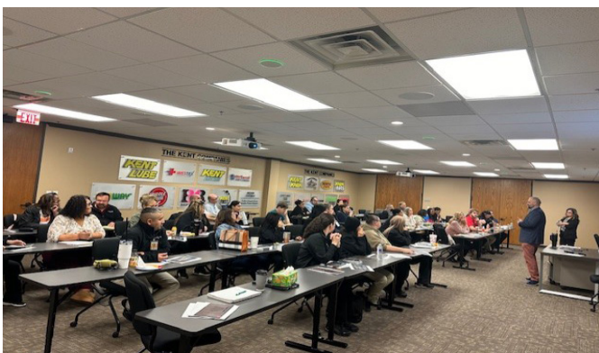
Yesterday, Food Service held their November training and development meeting. Keep learning and growing! We appreciate you.