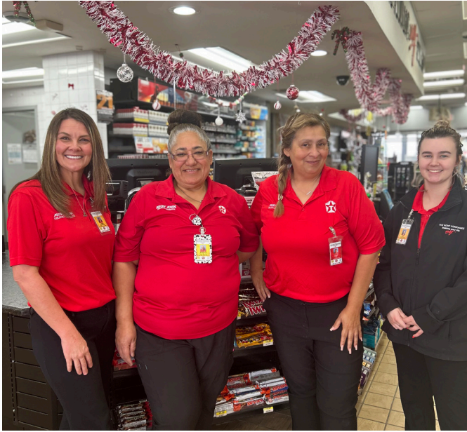
315 was all decorated for Christmas!

These Team Members were greeting Guests with a smile on Christmas Eve!