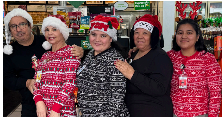
Merry Christmas from Team 952!