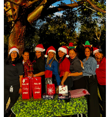
Merry Christmas from Team 963!