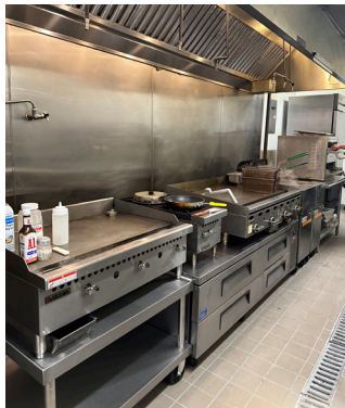
Rustic 440 just got all new floors!

Look at this amazing reindeer made for Christmas!