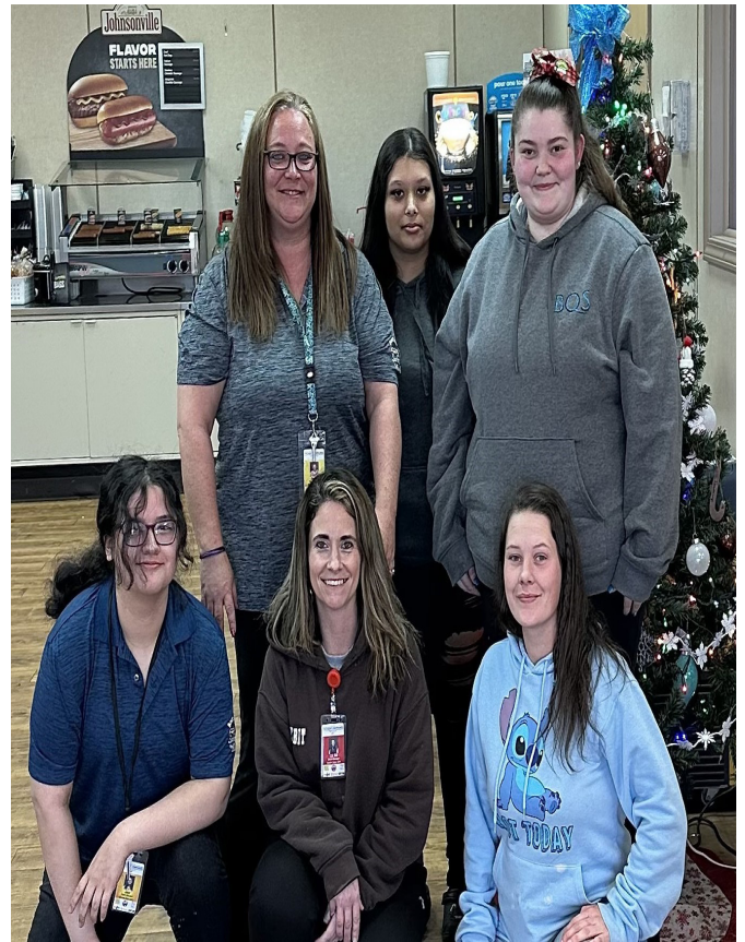
The Team at 706 having a Christmas Dinner.