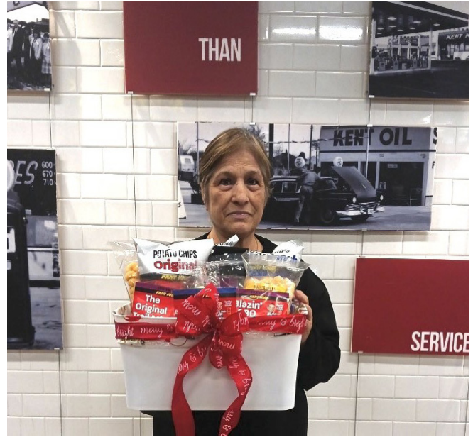
Last week we posted 5 days of Christmas giveaways on our social media pages. Here is one of the winners picking up her goodie basket from 433.

These Team Members were greeting Guests with a smile on Christmas Eve!