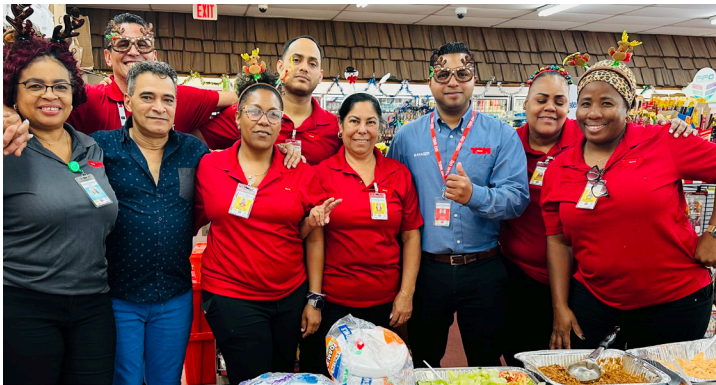
Merry Christmas from Team 951!