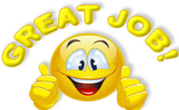
Great job to the store 711 for scoring 100% on their Period 13 Customer 1st Mystery Shop!!