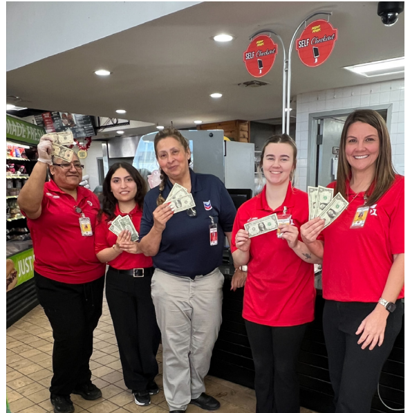
The 315 team has hit 10,779 for PBRC! Their goal is 15,000!