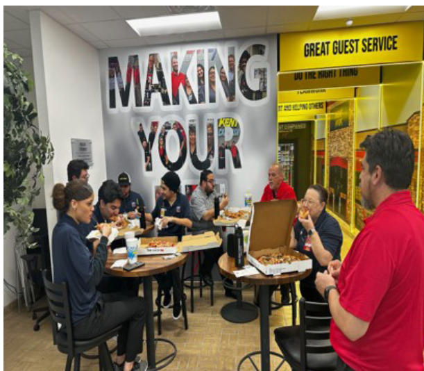
Left Bottom: Enjoying a well deserve break during new hire training.