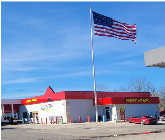
The American flag flying high at store 903.