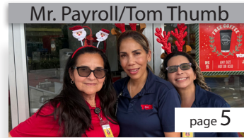
Mr. Payroll/Tom Thumb