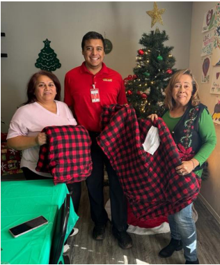
District 8 collected blankets for seniors for Christmas! Way to go, Team.