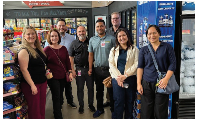
We were happy to welcome a Team from Chevron who visited store 485 in Houston. We had folks visiting from Houston, California and Malaysia!

Our thanks to the Team at 485 for hosting the visit.