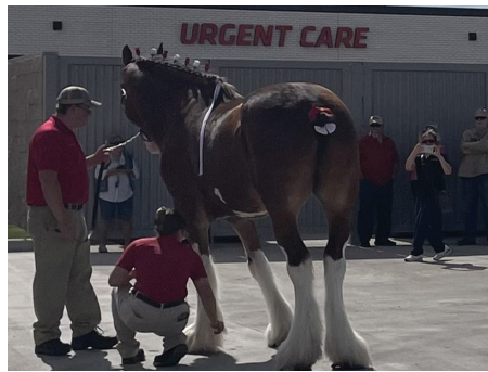
The Clydesdale getting his 'feathers' cleaned and brushed outside of 9109.